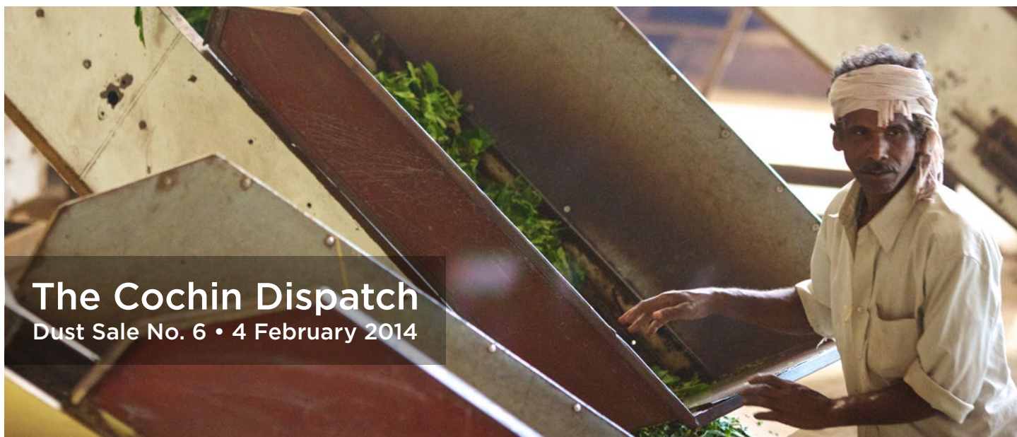
Save the leaf—it's precious.

In the sixth Cochin dust sale of the year, 84% of the offerings were sold at an average price of $1.80 (+1¢, 0.5%). While there was healthy cross-sectional demand—84% of the quantity sold—markets again failed to reflect this in the average sale price, as Tata Global Beverages did not operate.