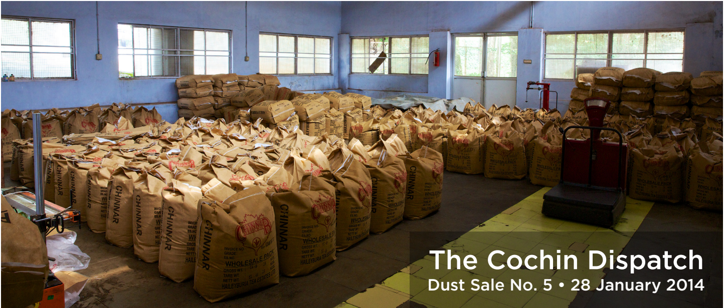
Chinnar: Made in Kerala, enjoyed all over the world.

In the fifth Cochin dust sale of the year, 79% of the offerings were sold at an average price of $1.79 (+2¢, 1.13%). While overall demand improved, sluggishness ensued as local and upcountry traders remained subdued.