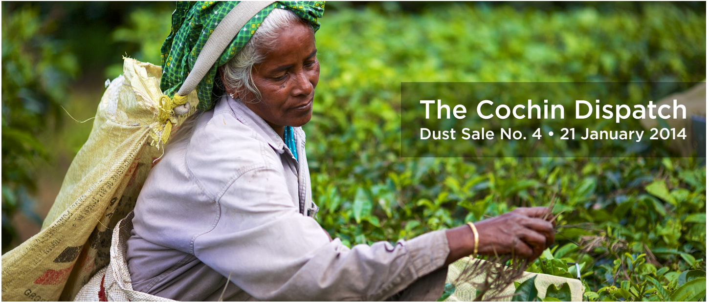
Has Cochin treated her right?

In the fourth Cochin dust sale of the year, 69% of offerings were sold at an average price of $1.77 (-9¢, -4.83%).