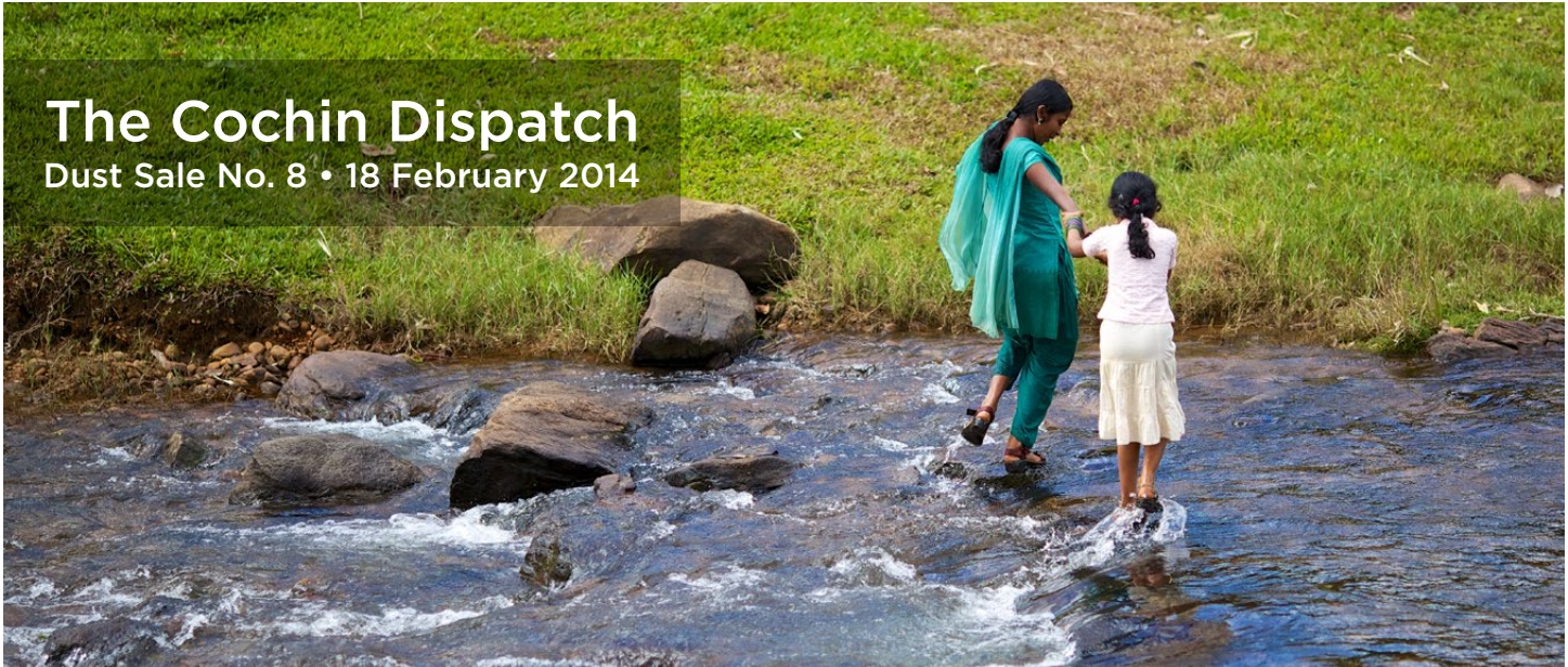
Has the Kerala Model been vindicated again?

In the eighth Cochin dust sale of the year, 85% of the offerings were sold for an average price of $1.83 (-1¢, -0.8%). In addition to local and upcountry traders, exporters also were subdued, resulting in weakness.