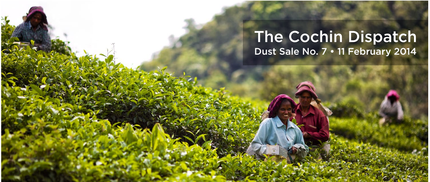
South India: An unlikely but emerging source for well-made CTCs.

In the seventh Cochin dust sale of the year, 88% of the offerings were sold at an average price of $1.84 (+5¢, 2.79%). Buyers continued to chase well-made teas, while they remained indifferent to the rest.